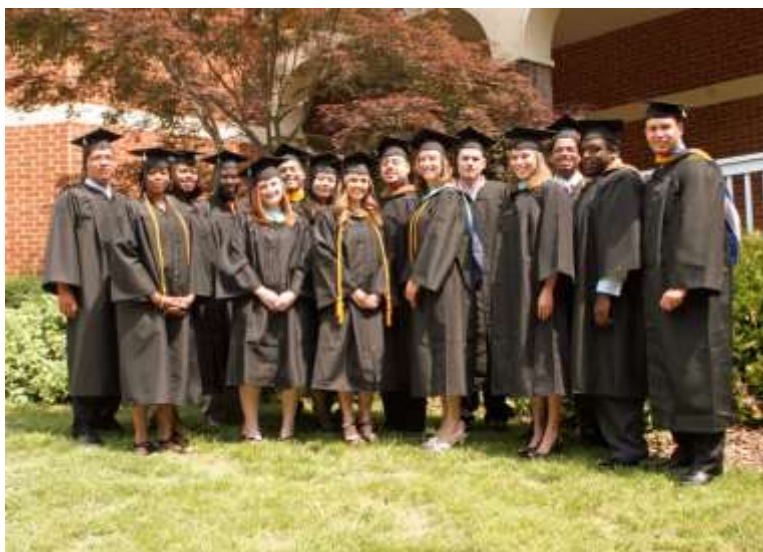
Graduating Class of 2011